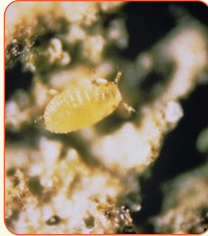
Beech Scale Cryptococcus fagisuga