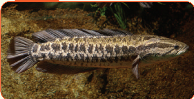
Snakehead, Northern Channa argus