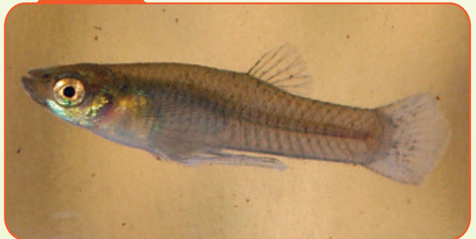
Mosquitofish, Western Gambusia affinis