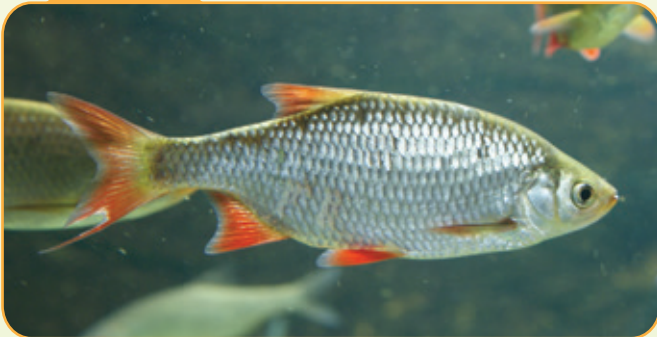
Rudd Scardinius erythrophthalmus