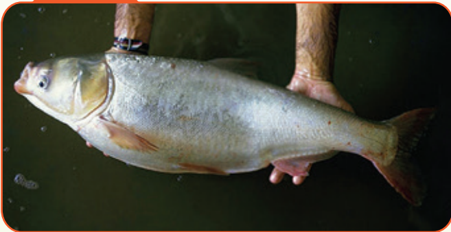
Carp, Largescale Silver Hypophthalmichthys harmandi