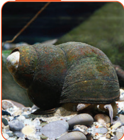
Mystery Snail, Japanese Bellamya japonica