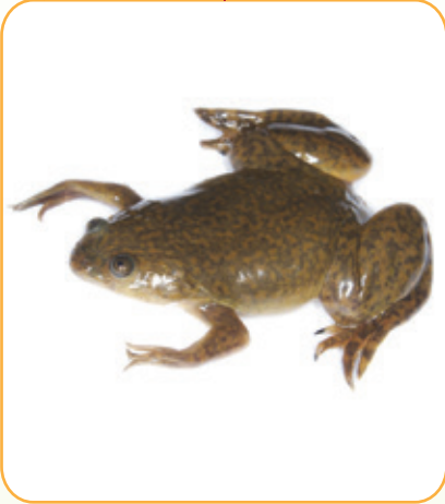
African Clawed Frog Xenopus laevis