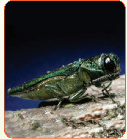
Emerald Ash Borer Agrilus planipennis