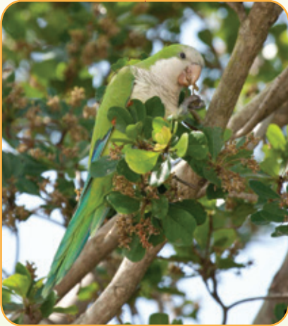
Monk Parakeet Myiopsitta monachus