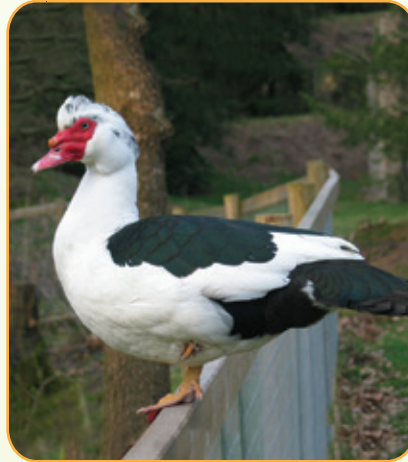
Muscovy Duck Cairina moschata