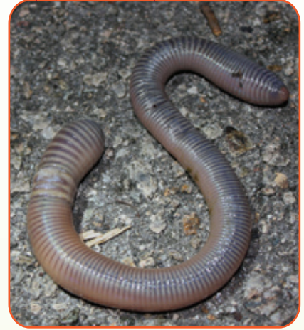
Asian Earthworms Amyntas spp.