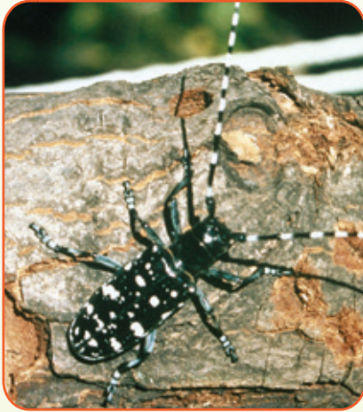
Asian Longhorned Beetle Anoplophora glabripennis