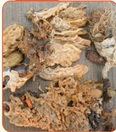
Carpet Tunicate Didemnum spp.