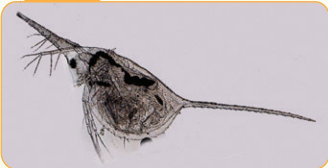
Water Flea Daphnia lumholtzi