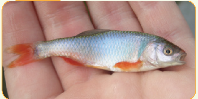
Red Shiner Cyprinella lutrensis