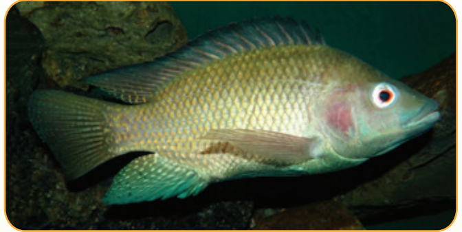
Tilapia, Nile Oreochromis niloticus