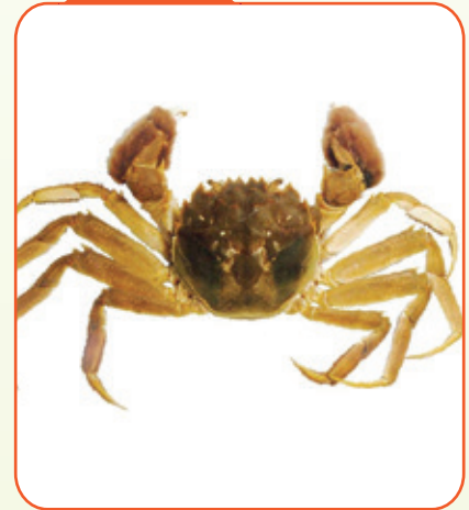
Chinese Mitten Crab Eriocheir sinensis