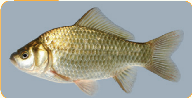
Goldfish Carassius auratus