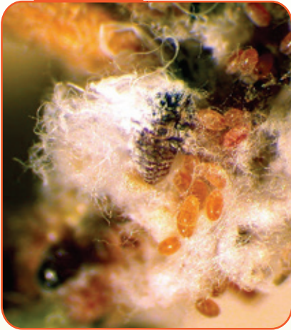
Hemlock Woolly Adelgid Adelges tsugae