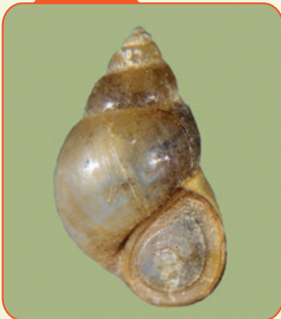
Faucet Snail Bithynia tentaculata