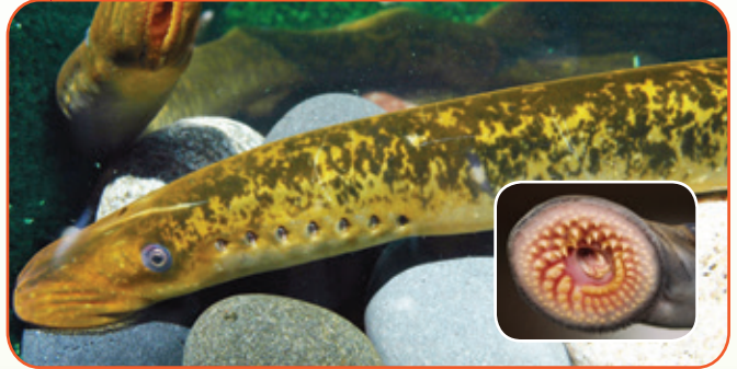
Sea Lamprey Petromyzon marinus