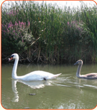
Mute Swan Cygnus olor