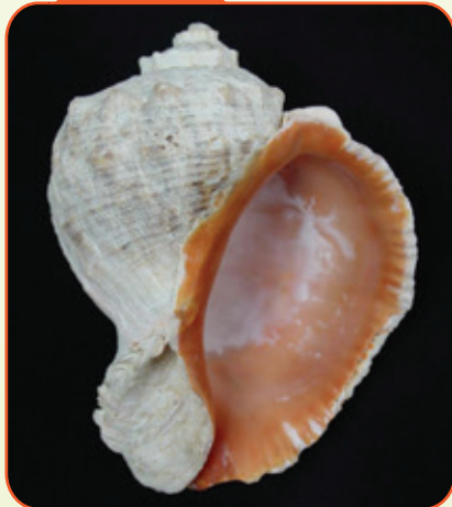
Veined Rapa Whelk Rapana venosa