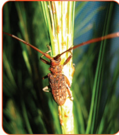
Japanese Pine Sawyer Monochamus alternatus