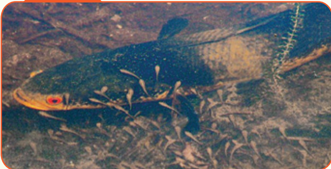
Snakehead, Bullseye Channa marulius