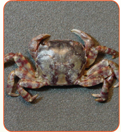
Asian Shore Crab Hemigrapsus sanguineus