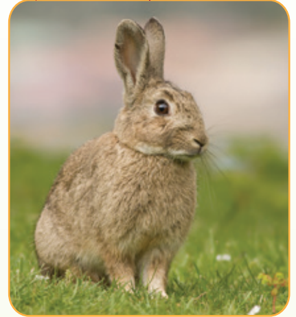
European Rabbit Oryctolagus cuniculus