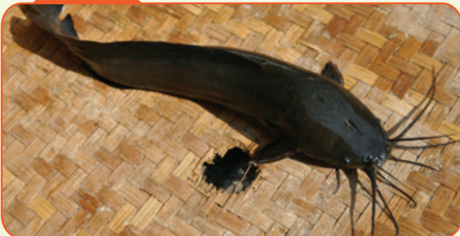
Walking Catfish Clarias batrachus