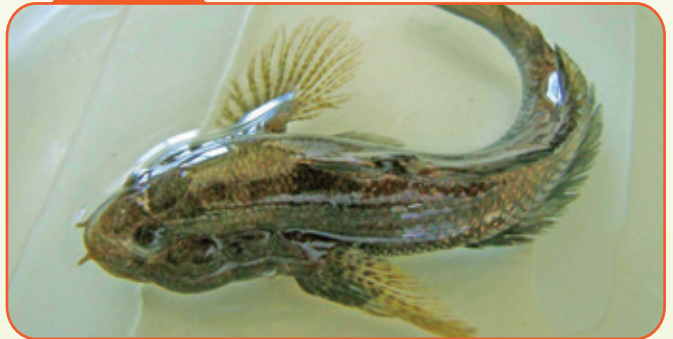
Goby, Tubenose Proterorhinus semilunaris (P. marmoratus)