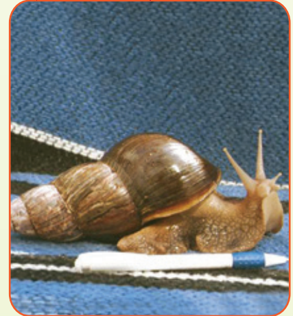
Giant West African Snail Archachatina marginata