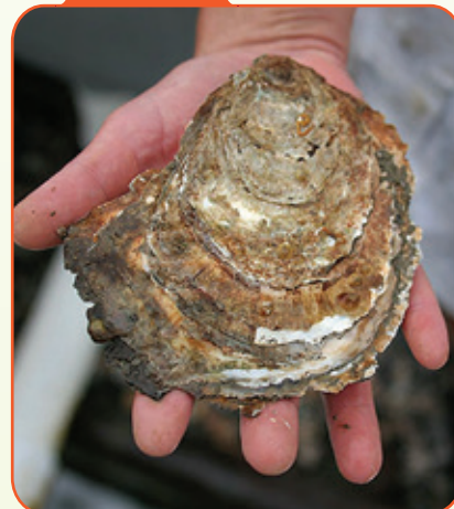
Suminoe Oyster Crassostrea ariakensis