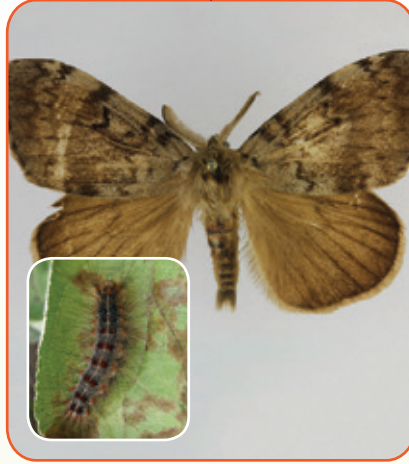
Asian and European Gypsy Moth Lymantria dispar