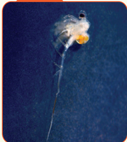
Spiny Water Flea Bythotrephese longimanus ( B. cederstroemi )