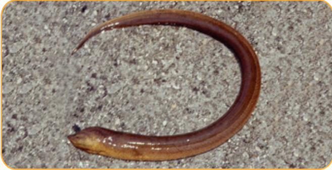
Asian Swamp Eel Monopterus albus