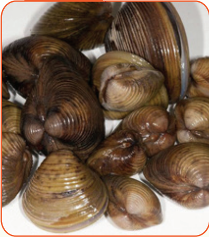
Asian Clam Corbicula fluminea