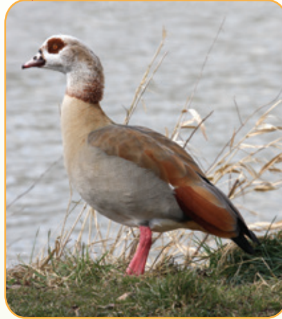
Egyptian Goose Alopochen aegyptiacus