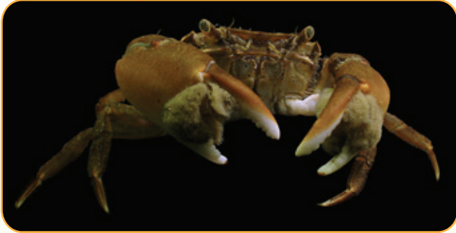
Crab, Brush-clawed Shore, Grapsid Hemigrapsus takanoi ( H. penicillatus )