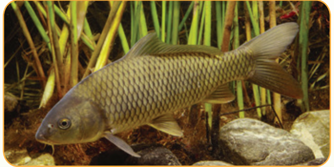
Common Carp, Koi Cyprinus carpio