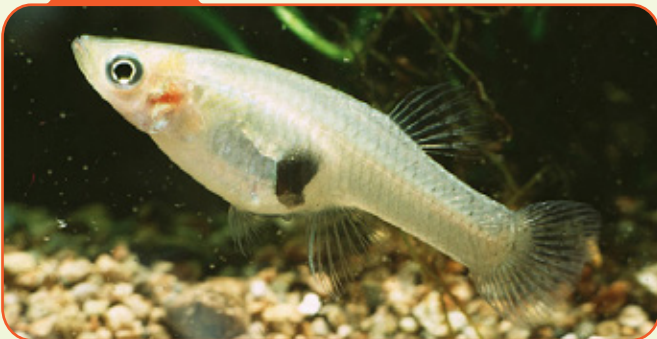
Mosquitofish, Eastern Gambusia holbrooki