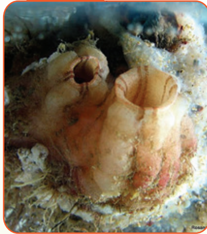
Asian Sea Squirt Styela plicata