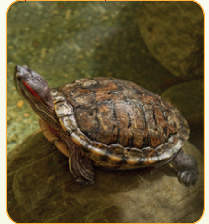
Red-eared Slider Trachemys scripta elegans