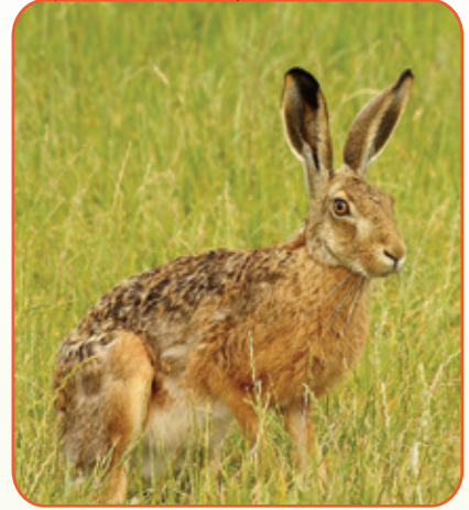
European Hare Lepus europaeus