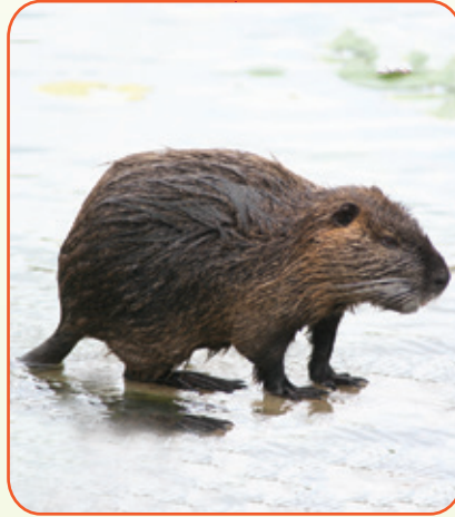
Nutria Myocastor coypus