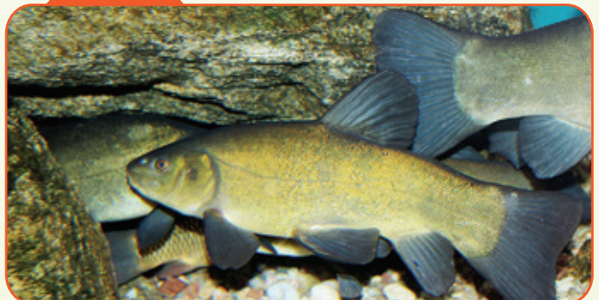
Tench Tinca tinca