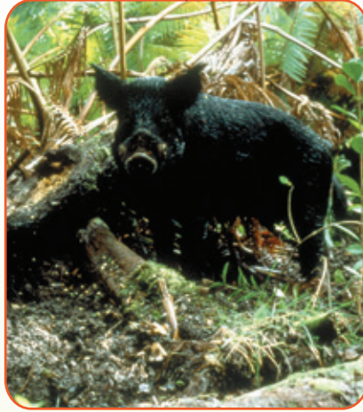
Eurasian Boar Sus scrofa (excluding Sus scrofa domestica )