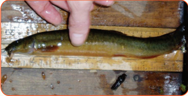
Oriental Weatherfish Misgurnus anguillicaudatus