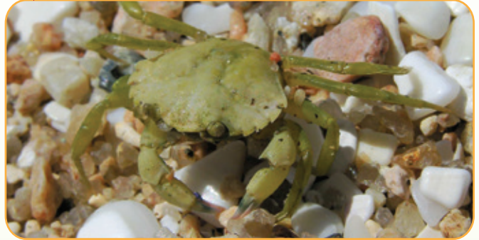
Crab, European Green Carcinus maenas