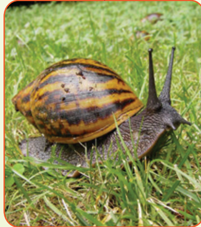
Giant Ghana Snail Achatina achatina