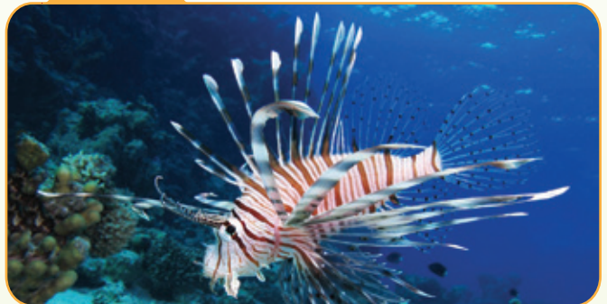
Lionfish, Common Pterois miles