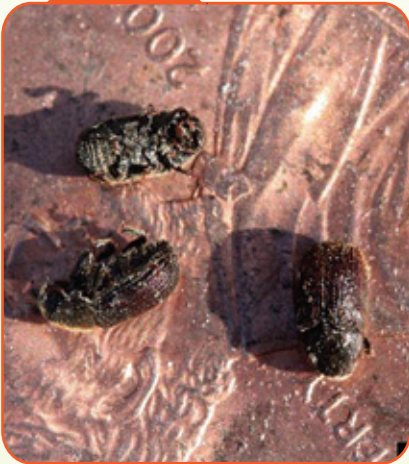
Walnut Twig Beetle Pityophthorus juglandis