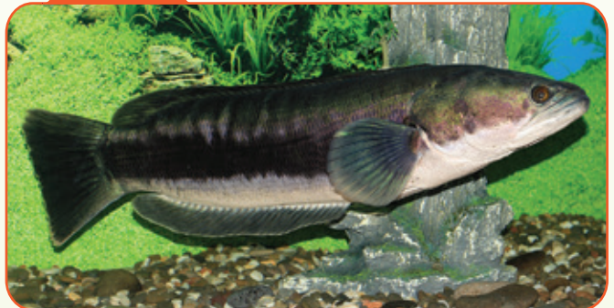
Snakehead, Giant Channa micropeltes