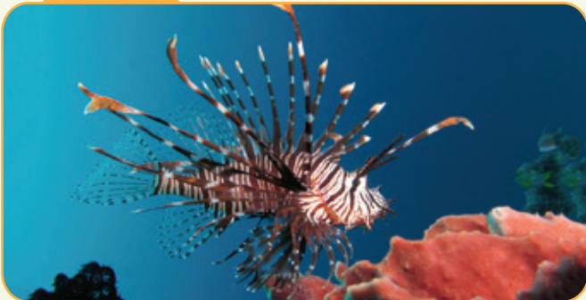
Lionfish, Red Pterois volitans