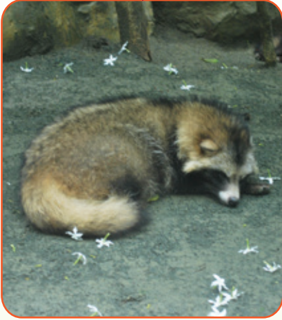
Asian Raccoon Dog Nyctereutes procyonoides