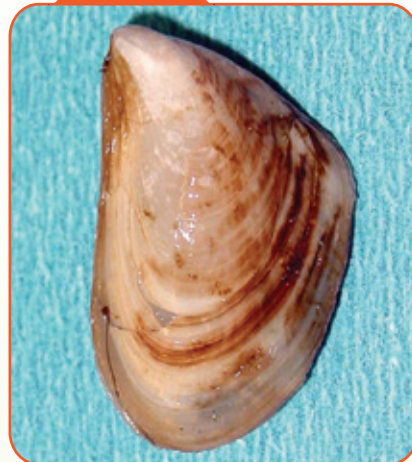
Quagga Mussel Dreissena rostriformis bugensis