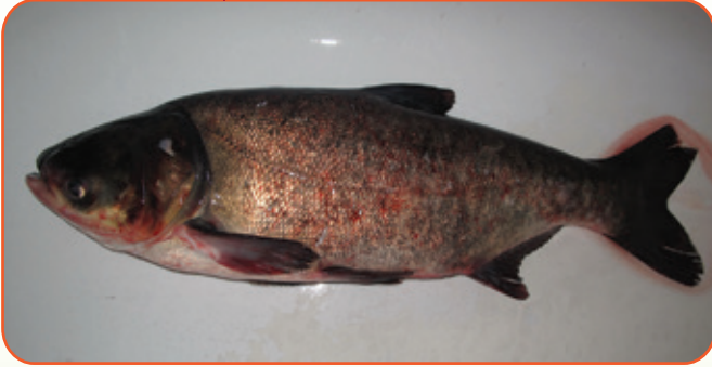
Carp, Bighead Hypophthalmichthys nobilis