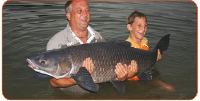
Carp, Black Mylopharyngodon piceus