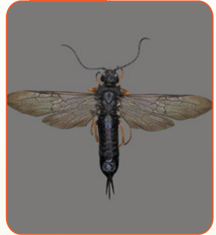
Sirex Woodwasp Sirex noctilio