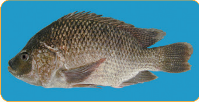
Tilapia, Blue Oreochromis aureus