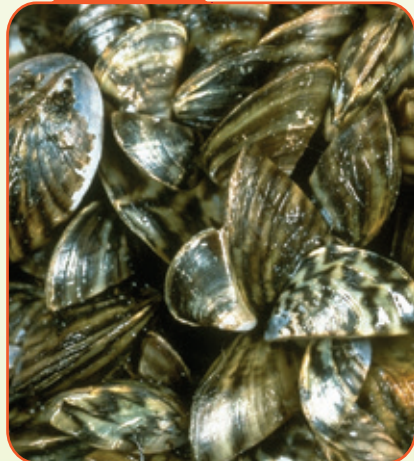
Zebra Mussel Dreissena polymorpha