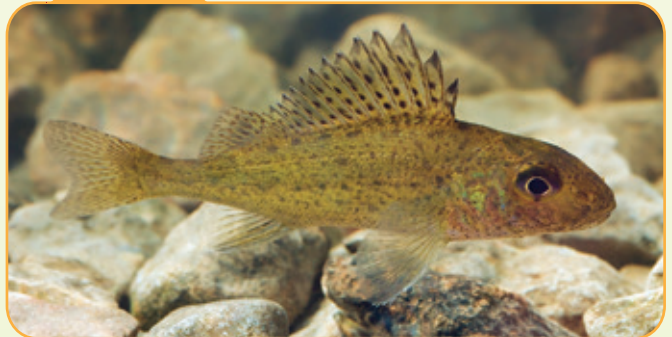
Ruffe Gymnocephalus cernuus