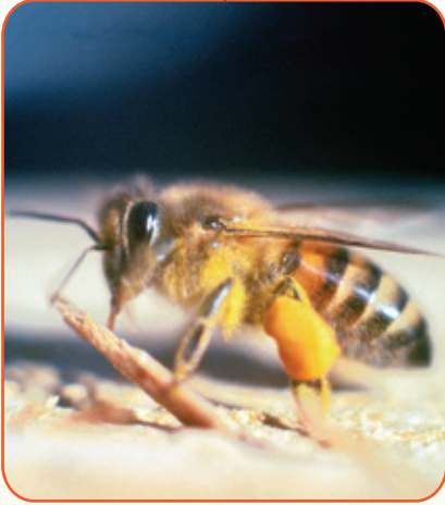
Africanized Honey Bee Apis mellifera scutellata x A. mellifera ligustica / A. mellifera iberiensis