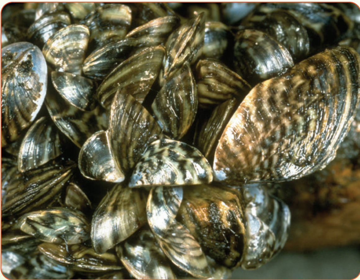
Zebra Mussel Dreissena polymorpha