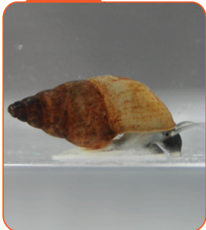
New Zealand Mud Snail Potamopyrgus antipodarum