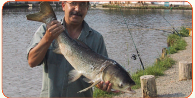
Carp, Silver Hypophthalmichthys molitrix