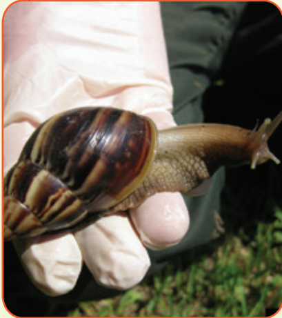
Giant African Land Snail Achatina fulica ( Lissachatina fulica )