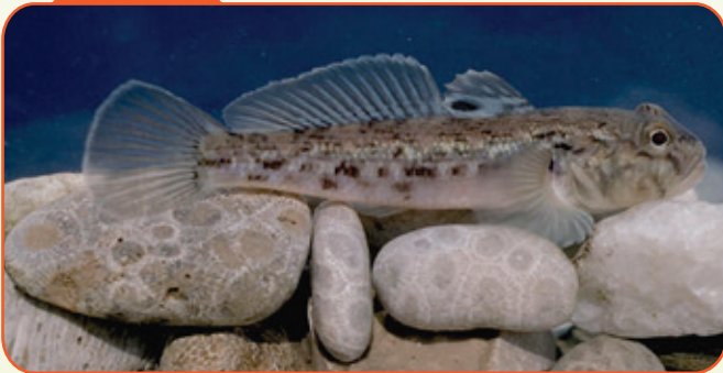
Goby, Round Neogobius melanostomus