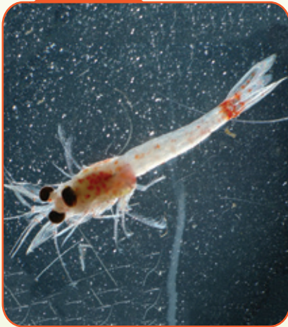
Bloody Red Shrimp Hemimysis anomala