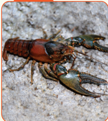
Rusty Crayfish Orconectes rusticus