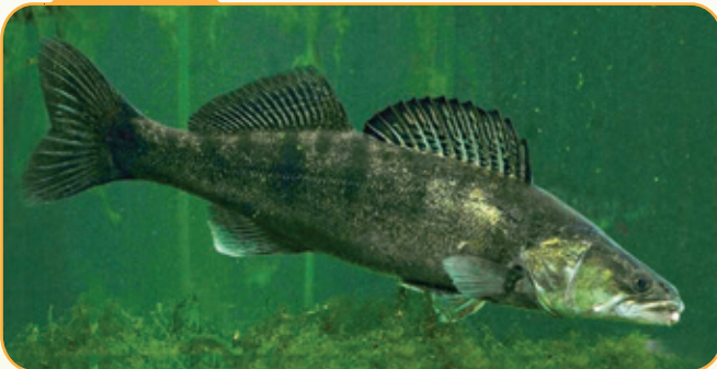
Zander Sander lucioperca (Stizostedion lucioperca)