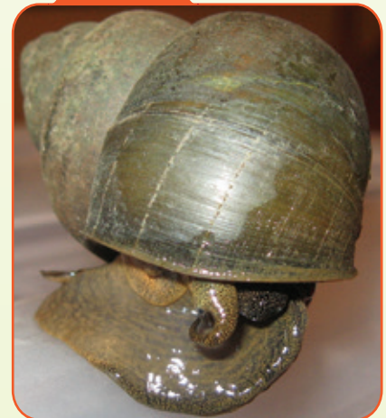
Mystery Snail, Chinese Bellamya chinensis ( Cipangopaludina chinensis )