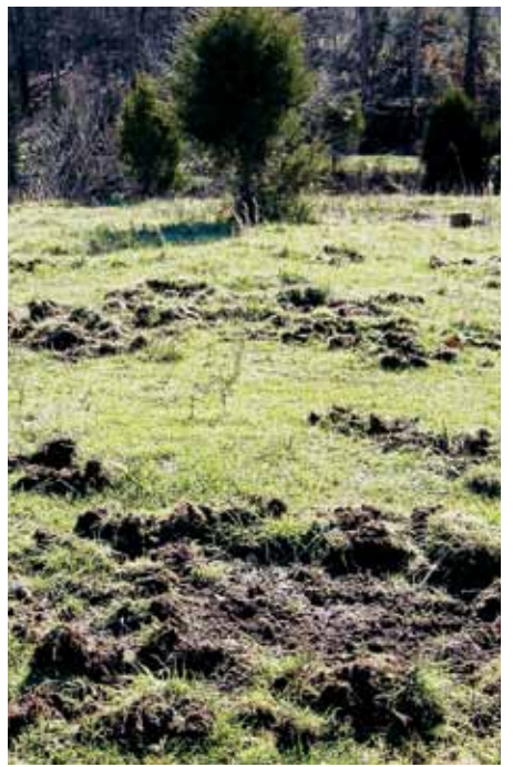
Feral hogs harm wildlife and destroy agriculture.