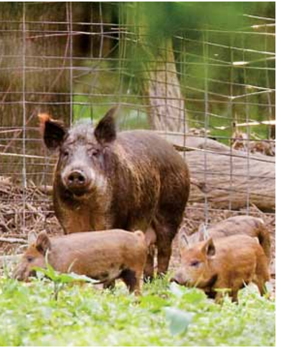
Sows can reproduce at six months and typically have two litters of 4–10 piglets each year. Their numbers can double or triple in just one year.