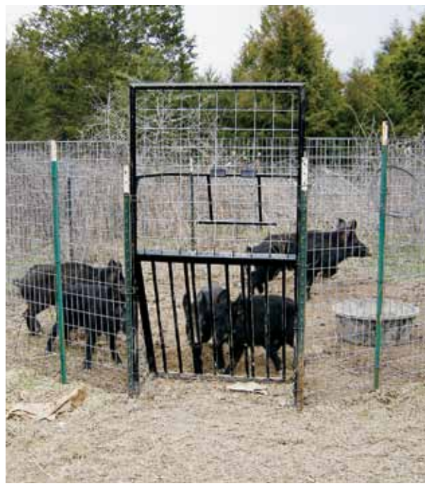
The Missouri Department of Conservation shoots, traps and snares feral hogs on public land. Hunters are encouraged to shoot feral hogs on sight.