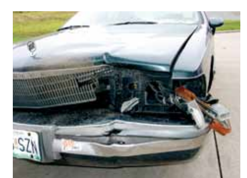
Feral hogs are a road hazard.

Report a feral hog sighting or kill to: USDA Wildlife Services—(573) 449-3033, ext. 13 or the Missouri Department of Conservation— (573) 522-4115, ext. 3147