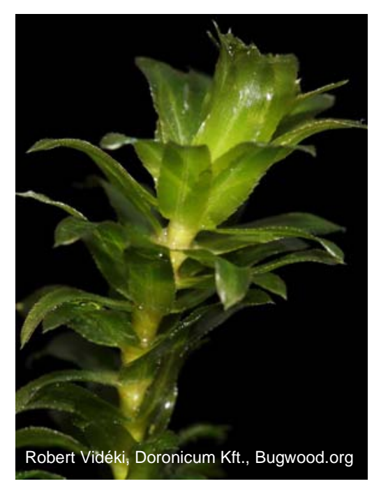
Close up of Hydrilla stem