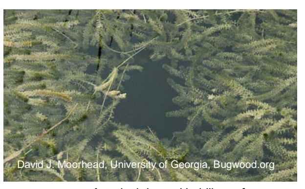
A typical dense Hydrilla surface mat