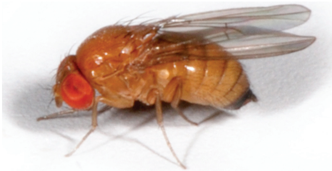
Fig. 1. Adult female Drosophila suzukii .