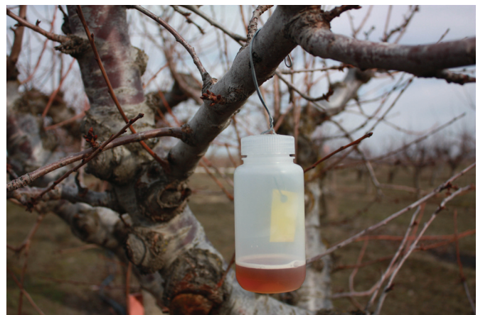
Fig. 7. D. suzukii trap deployed in a cherry orchard.

Biological Control. Parasitoid wasps (Braconidae and Cynipidae) are thought to be the primary Hymenopteran families targeting Drosophila spp. and have potential as biocontrol agents against D. suzukii