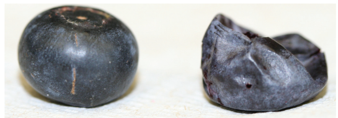
Fig. 5. Infested blueberry (right) exhibits soft, sunken areas two weeks after exposure to D. suzukii when compared with control blueberry (left).

Kanzawa observed that the fly oviposited most often on cherries, peaches, plums, persimmons, strawberries, and grapes in Japan, but