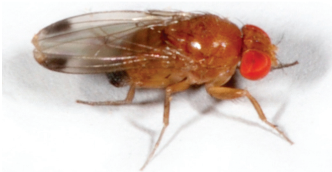
Fig. 2. Adult male; note dark spots on wing tips.

They have black stripes on the abdomen and males have a distinguishing dark spot on the leading edge near the tip of each wing. The spot may play a role in courtship but results are ambiguous for flies under diurnal light cycles (Fuyuma 1979). The female's serrated ovipositor (Fig. 3) is able to penetrate the skin of most thin-skinned fruit, leaving a small depression, scar, or "sting" on the fruit's surface (Fig. 4). A female lays \approx 1 –3 eggs per oviposition site, averaging 380 eggs in her lifetime. The number of eggs laid may depend on fruit maturity and eggs tend to be randomly distributed on cherry fruit (Mitsui et al. 2006). Multiple clutches of larvae are quite possible on