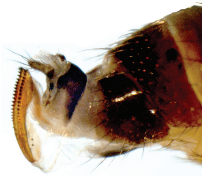
Fig. 3. Serrated ovipositor of D. suzukii .

They have black stripes on the abdomen and males have a distinguishing dark spot on the leading edge near the tip of each wing. The spot may play a role in courtship but results are ambiguous for flies under diurnal light cycles (Fuyuma 1979). The female's serrated ovipositor (Fig. 3) is able to penetrate the skin of most thin-skinned fruit, leaving a small depression, scar, or "sting" on the fruit's surface (Fig. 4). A female lays \approx 1 –3 eggs per oviposition site, averaging 380 eggs in her lifetime. The number of eggs laid may depend on fruit maturity and eggs tend to be randomly distributed on cherry fruit (Mitsui et al. 2006). Multiple clutches of larvae are quite possible on